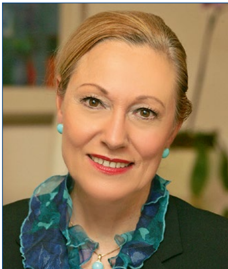
Keynote Speaker H.E. Dr Benita Ferrero-Waldner

Early arrivals will get to enjoy an optional, private VIP tour of the Madrid Palacio Real and some of its secret corners (not open to the general public). This Royal Palace of Madrid, one of the largest in Europe, stands on the site of the former Alcazar of Madrid, a medieval fortress transformed into a lavish palace by John II, Charles V and Phillip II, who in 1561 made it the