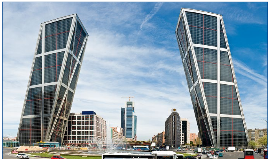
Puerto de Europa (The Gate of Europe towers), Madrid

official residence of the Spanish Monarchy. Phillip V then decided to build a new Royal Palace on this site.