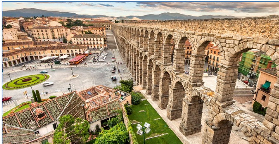
The famous ancient aqueduct in Segovia, Castilla y Leon

was organised and dominated by belonging to one of the different cultural communities. The evidence of this cultural process can be seen in the large number of outstanding monuments in the city, among which the Roman Aqueduct stands out. Other important monuments can be visited, such as the Alcázar (begun around the 11th century), several Romanesque churches, noble palaces from the 15th and 16th centuries, the 16th-century Gothic cathedral (the last to be built in Spain in this style).